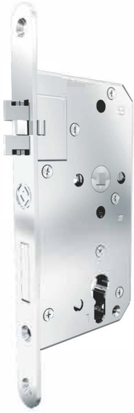
Cabin Door Lock

Locks are manufactured from pure stainless material. Moving system and parts are designed for a long life and proper functionality. Easily and smoothly crosses with its' specific lock bolt.