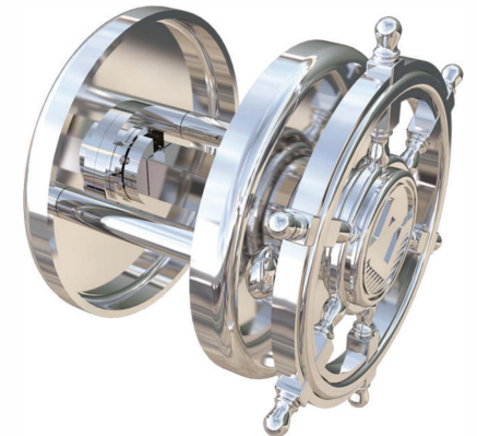
Lid Handle and Elements

Manufactured from pure stainless material. A special design for mariners. Very stylish, handy and durable.