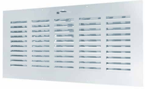
Louver for Cabin Doors

Manufactured from stainless or DKP plate painted with electrostatic powdered paint. Collapsible.