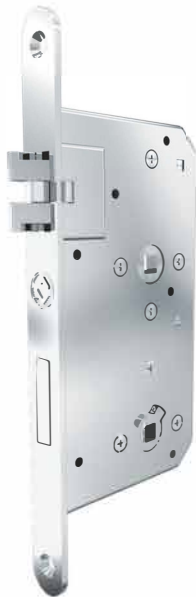
WC Door Lock

Locks are manufactured from pure stainless material. Moving system and parts are designed for a long life and proper functionality. Easily and smoothly crosses with its' specific lock bolt.