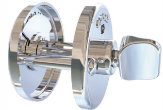
WC Door Handle and Elements

Manufactured from pure stainless material. Handy, elegant and durable. Lock mechanism has a open/locked indicator.