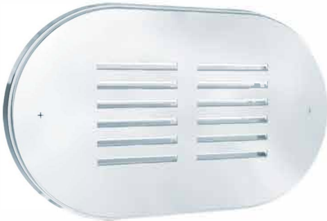
Louver for Ceilings

Designed to be used in wet areas. Manufactured from stainless material. IP55 Certificated.