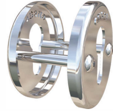
Door Handle and Elements

Manufactured from pure stainless material handy, elegant and durable.