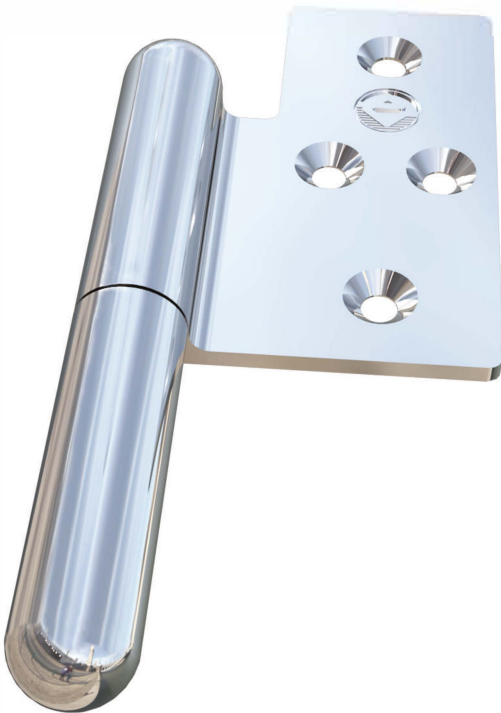
Class A-15/B15 Door Hinge

Hinges are manufactured weldless as monolith by using pure stainless material. Durable, handy and lasting.