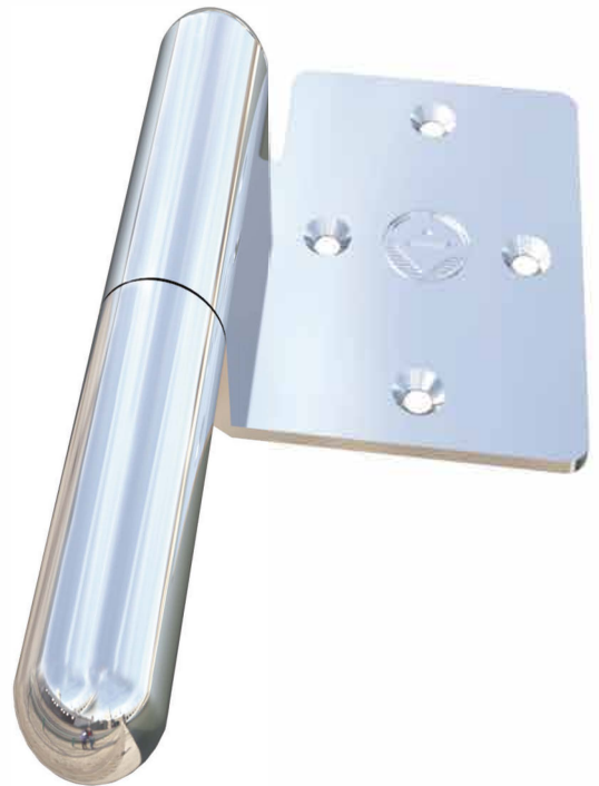
Class A-60 Door Hinge