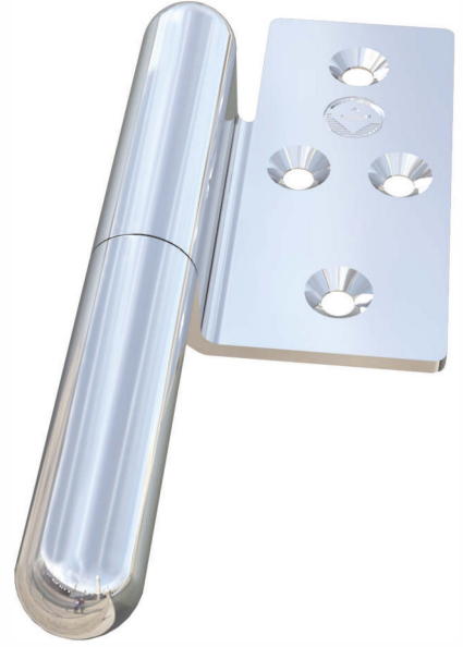
Stainless Steel Glased Door Hinge

Hinges are manufactured weldless as monolith by using pure stainless material. Durable, handy and lasting.